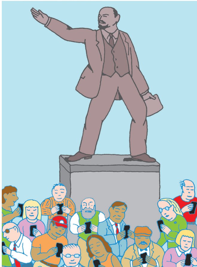
Social media can't provide what social change has always required.

numbered three hundred, including three white women, from the Greensboro campus of the University of North Carolina. By Saturday, the sit-in had reached six hundred. People spilled out onto the street. White teen-agers waved Confederate flags. Someone threw a firecracker. At noon, the A. & T. football team arrived. "Here comes the